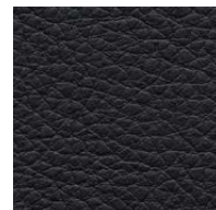
Riga Pattern+ Leather