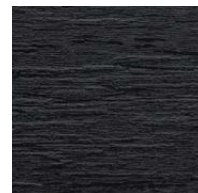
Riga Pattern+ Slatewood