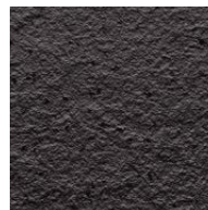
Riga Pattern+ Rock